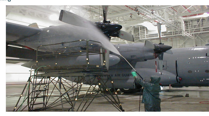
To Use Manually or with low Pressure Washing