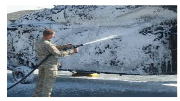
To Use with Foam Generating Equpment